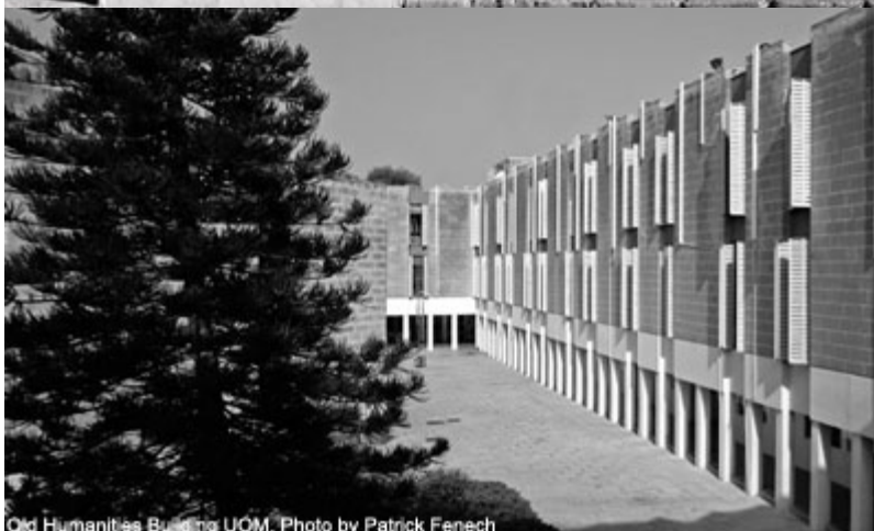
Old Humanities Building UOM.