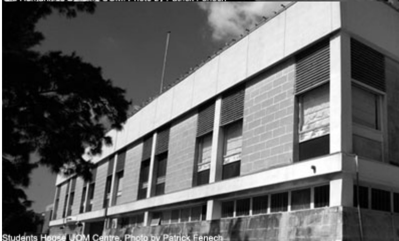
Students House UOM Centre.